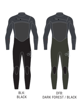
INFINITI 5/4MM MR543Z19