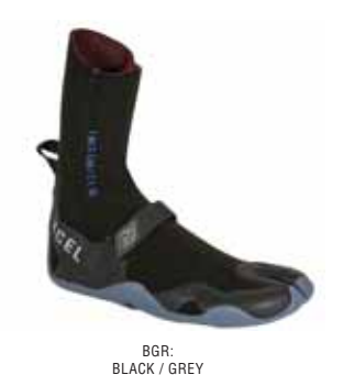
WOMEN'S/YOUTH INFINITI SPLIT TOE BOOT 3MM ATW37017

SINGLE RUBBER BOTTOM DURABILITY WITH BOARD FEEL