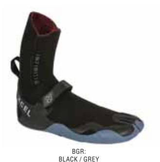
INFINITI SPLIT TOE BOOT 5MM AT057017