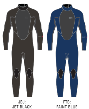
JBJ: JET BLACK