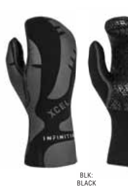
INFINITI MITTEN 5MM AT557387