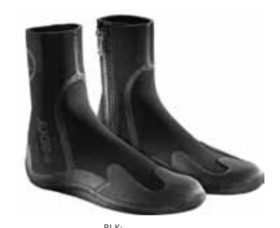
TODDLER AXIS ROUND TOE BOOT W/ SHORT ZIP 3MM ANK388X8