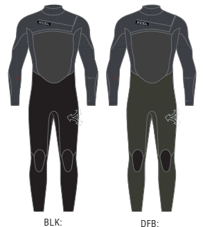
DFB: DARK FOREST / BLACK