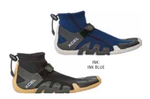
GUM: BLACK / GUM