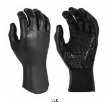
INFINITI GLIDE SKIN GLOVE W/TEXT PALM 2MM