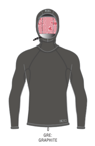
INFINITI L/S 1MM BODY W/ INSULATE-X SLEEVES, 2MM RR HOOD W/ BILL & NECK DAM ANR416H9