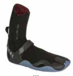
BGR: BLACK / GREY