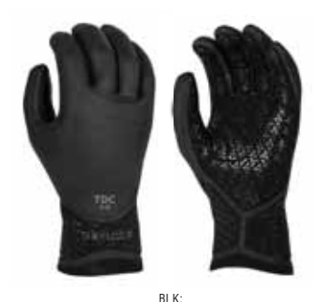
DRYLOCK TEXTURE SKIN 5 FINGER GLOVE 3MM ACV39387