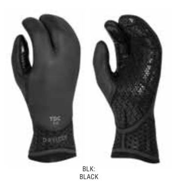
DRYLOCK TEXTURE SKIN 3 FINGER GLOVE 5MM ACV57387