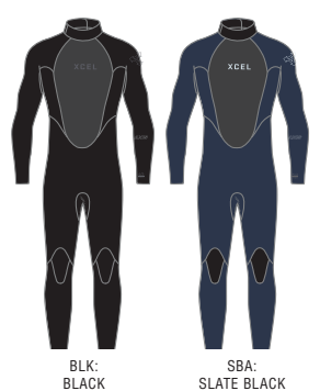
AXIS BACK ZIP 4/3MM