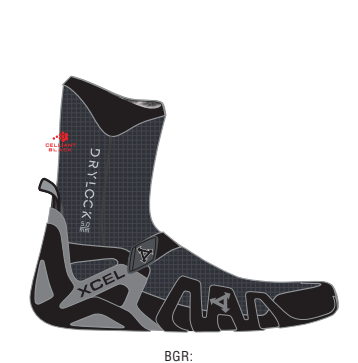
DRYLOCK SPLIT TOE BOOT 5MM