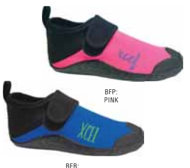
BEB: ELECTRIC BLUE