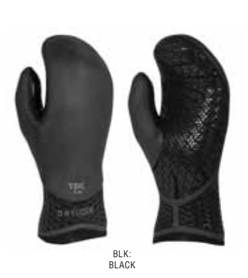
DRYLOCK TEXTURE SKIN MITTEN 7MM ACV77387