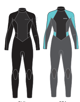
AXIS BACK ZIP 5/4MM WT54AX18