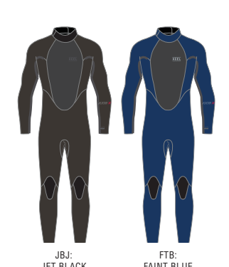
AXIS X BACK ZIP 5/4MM MT54AOS8