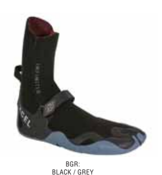
INFINITI SPLIT TOE BOOT 3MM AT037017