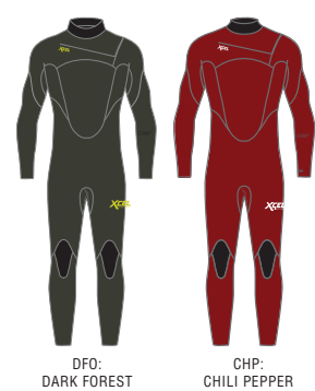
DFO: DARK FOREST