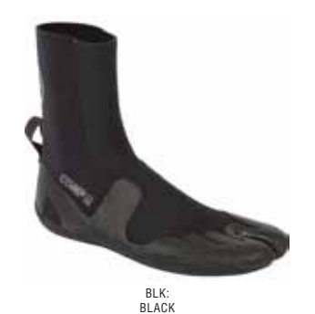
COMP SPLIT TOE BOOT 3MM AN36COM7