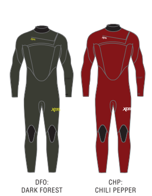
COMP 5/4MM KN54ZXC9