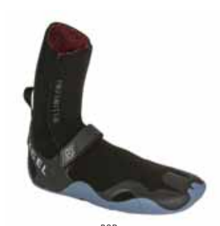
BGR: BLACK / GREY