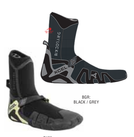
GUM: BLACK / GUM