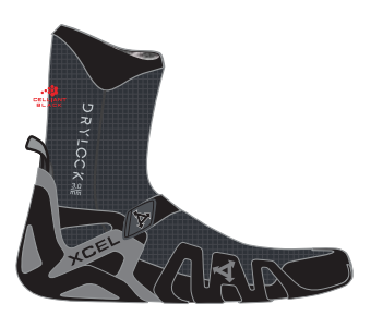
BGR: BLACK / GREY