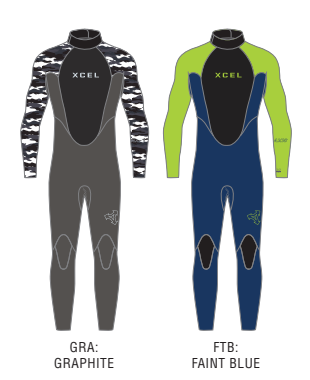
AXIS BACK ZIP 4/3MM KT43AX19