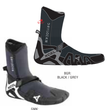
GMK: GUNMETAL / BLACK