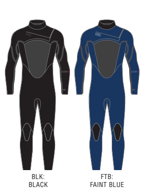
AXIS X 3/2MM MT32Z2S9