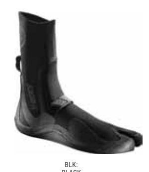
AXIS SPLIT TOE BOOT 3MM