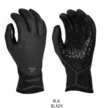
DRYLOCK TEXTURE SKIN 5 FINGER GLOVE 5MM