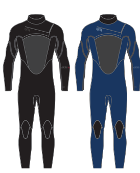
FTB: FAINT BLUE