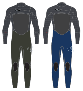
DFB: FGU: DARK FOREST / BLACK FAINT BLUE / GUNMETAL